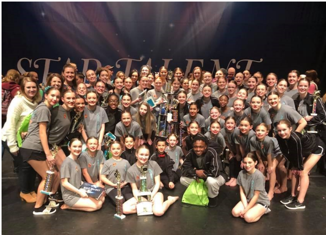
2018 Company Production All You Need Is Love

There will be a poster in the lobby with sheets to put your name, age at the time of auditions, and school grade. There is a $25 audition fee and you must pay for summer classes and registration. We are looking forward to next year and have many great plans already. We hope you will join us! Look for more information in next month's newsletter.