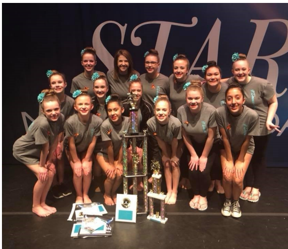
"A Little Party" Highest 12 and Under Excel Group

We are very proud of all of our dancers. You looked amazing and you also had great attitudes! Thanks for representing our studio well! Don't forget to look for an article in the Wake Weekly about our accomplishments! You can also see pictures on our Facebook page!